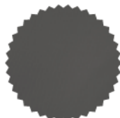
563 basalt grey