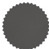
563 basalt grey