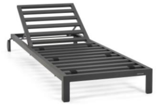
cushion set included: seat + back