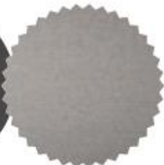
705 taupe grey