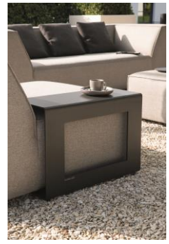
optional Davenport side tables 99940