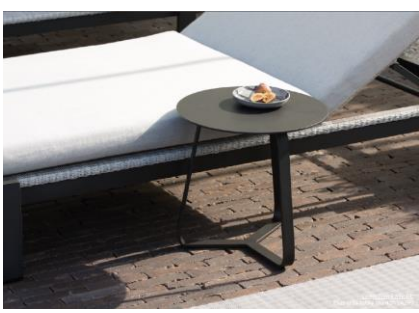
mix & match