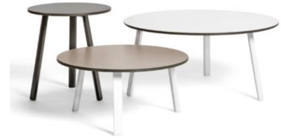
mix & match