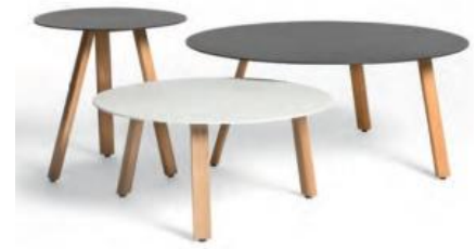
mix & match