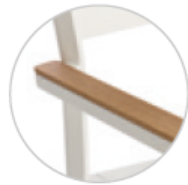
optional teak arm